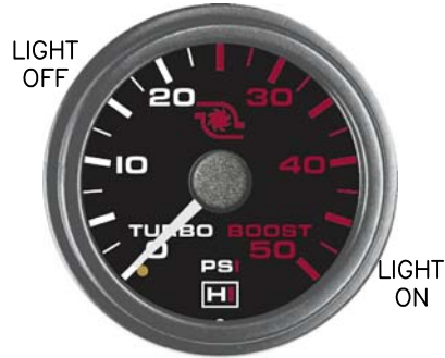
P/N 102-102-3W-1 SCALE: 3/4