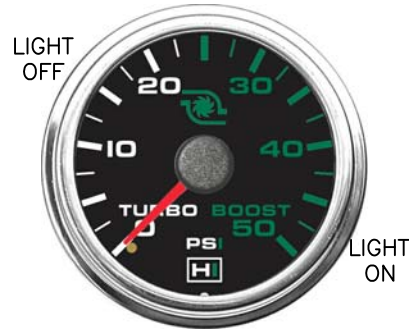
P/N 102-102-4R-2 SCALE: 3/4