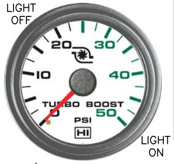
P/N 102-102-2R-1 SCALE: 3/4

DIAL FACE COLORS POINTER COLOR BEZEL COLOR & STYLE