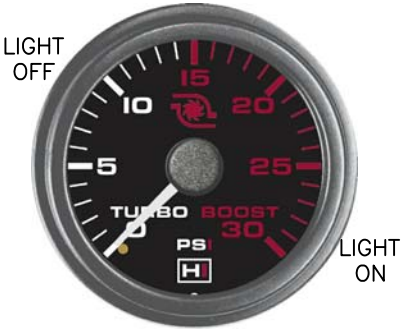
P/N 102-101-3W-1 SCALE: 3/4