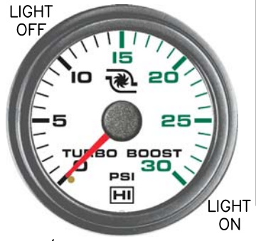
P/N 102-101-2R-1 SCALE: 3/4

DIAL FACE COLORS POINTER COLOR BEZEL COLOR & STYLE