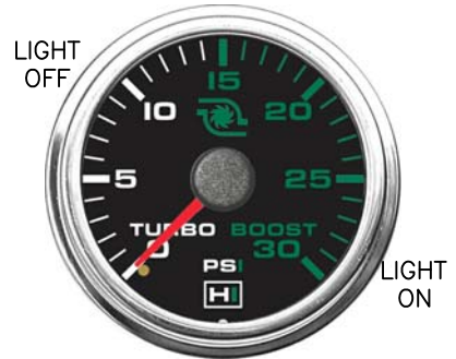
P/N 102-101-4R-2 SCALE: 3/4