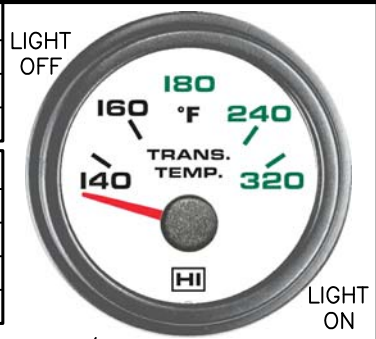
P/N 011-103-2R-1 SCALE: 3/4