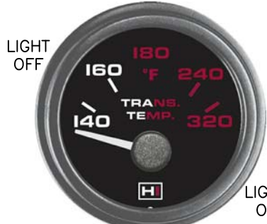
P/N 011-103-3W-1 SCALE: 3/4

DIAL FACE COLORS POINTER COLOR BEZEL COLOR & STYLE