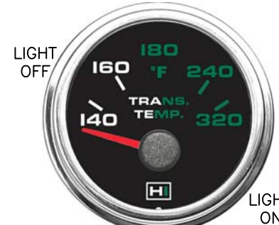
P/N 011-103-4R-2 SCALE: 3/4